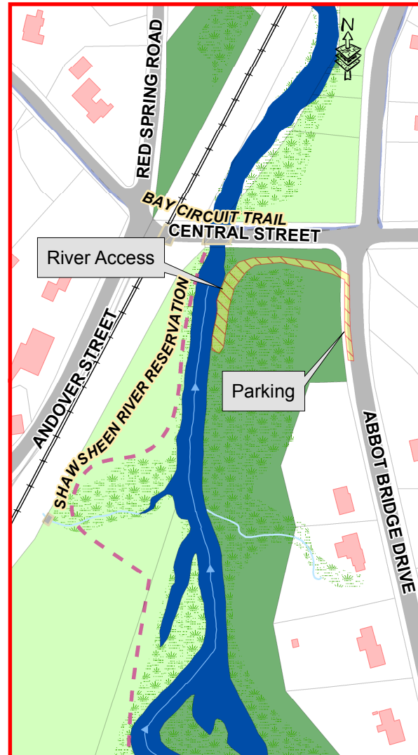
Abbot Bridge Drive Access and Parking